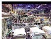
INTERNATIONAL PAPER SPRINGFIELD MILL EXPANSION Springfield, OR