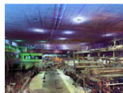
GEORGIA-PACIFIC Toledo, OR

About half of A/E/C BIM users rated the following factors strongly: 1) decreased material waste due to reduced rework and 2) less on-site labor due to more off-site prefabrication. Let the Epic Scan team provide the data you need to make BIM to work for your projects. (See Smart Market Brief for details.)