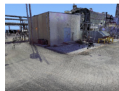
KOCH FERTILIZER AMMONIA-UREA PLANT EXPANSION Dodge City, KS